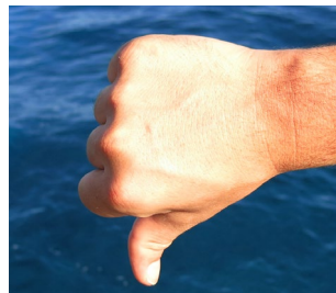
Descend (go down)