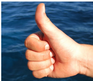
Ascend (go up)

Try to copy each of the dive signs. Scientists working underwater must remember them all. When you are ready try out the dive signs on your partner. Can your partner work out what you are communicating to them? What does your partner reply?