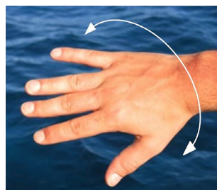
Something is wrong