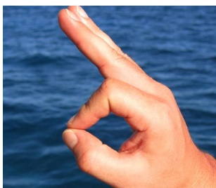
Are you OK? I am OK?