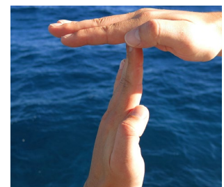
Time to head back